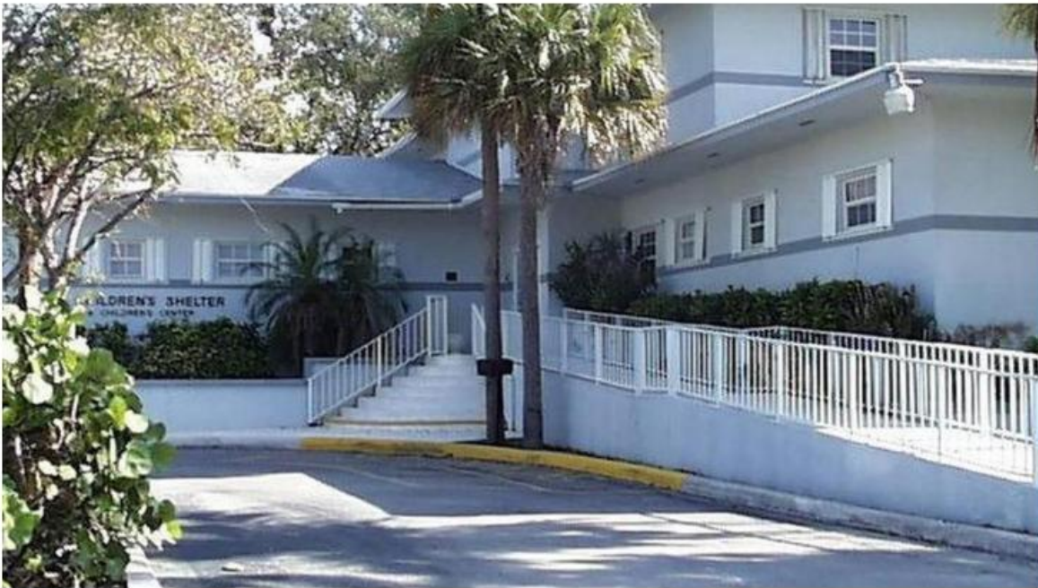
Florida Keys Children's Shelter

The Florida Keys Children's Shelter and two other Monroe County nonprofits will settle out of court a federal lawsuit claiming the agencies failed to protect a 17-year-old girl from being sold into sex trafficking.